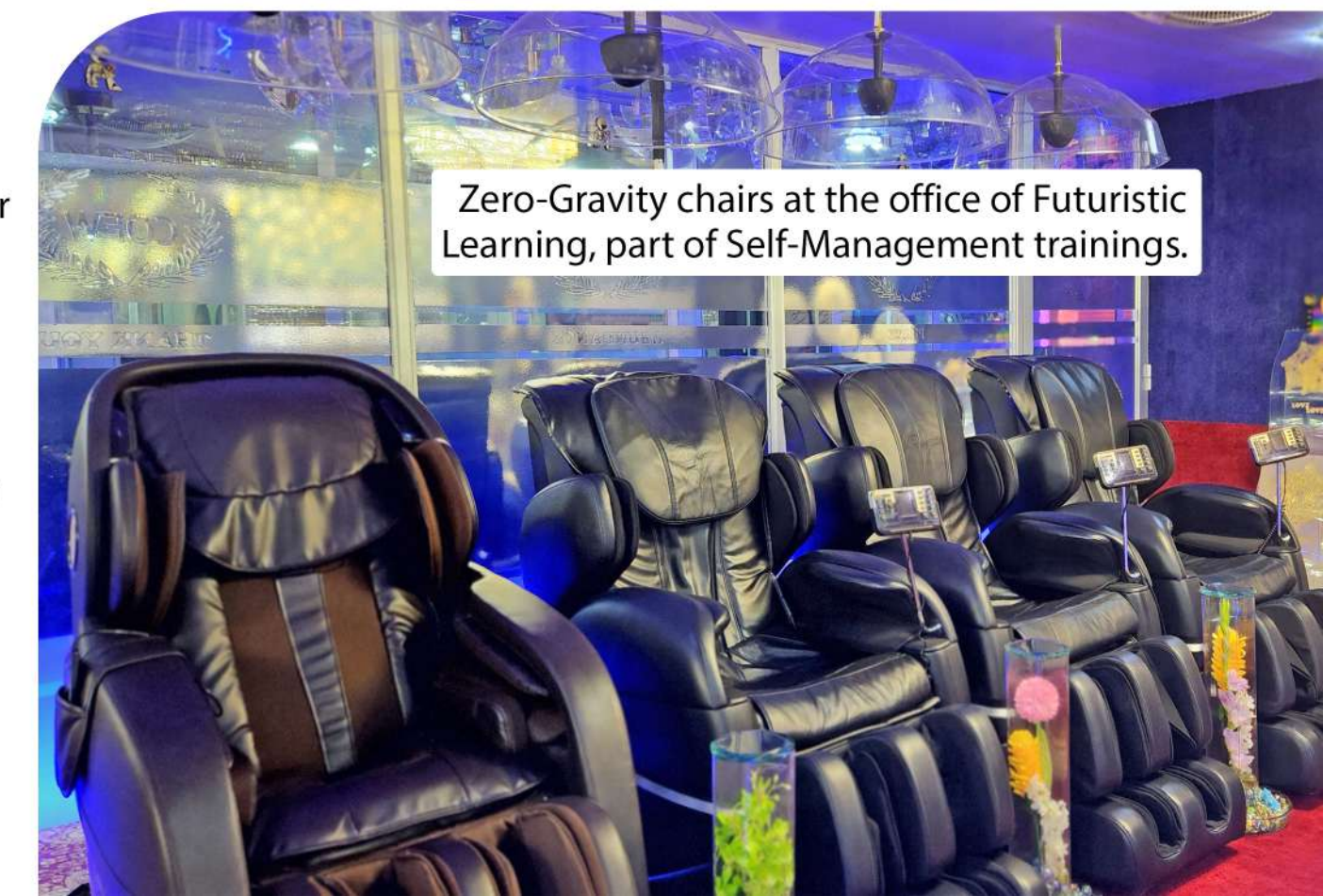
Zero-Gravity chairs at the office of Futuristic Learning, part of Self-Management trainings.

• Zero-Gravity Experience – At our facility we have multiple zero-gravity massage chairs which recline the body into a position in which there is no force of gravity acting on the body, and accurately targeting pain points to alleviate fatigue and accumulated body stress. The zero-gravity technology was invented by NASA. Astronauts going on space missions assume a zero-gravity position during liftoff, to avoid the intense stress during the sudden increase in gravity while escaping Earth's gravitational pull.